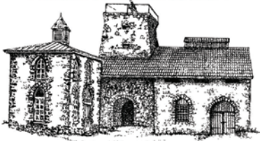
Joanna Furnace 1791 - 1898