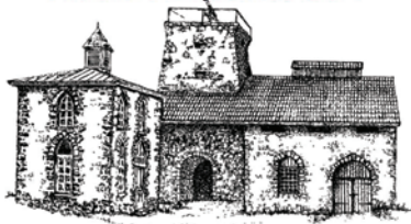
Joanna Furnace 1791 - 1898